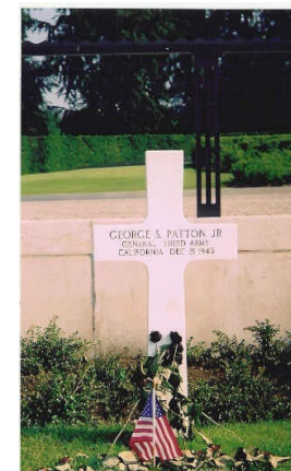
Left: The Sherman tank of the 11th US Armored Division "Thunderbolt" was completely renovated and is a major monument in Bastogne. Right: Patton's Grave in Luxembourg.