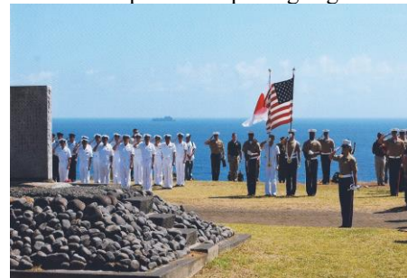
Ceremony on Iwo Jima during 2010 visit. Everyone is expected to attend ceremony before touring the island.

Transfer to airport for departing flights...or continue onto Koror and Peleliu.