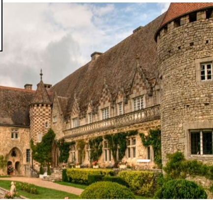
We will spend four nights at the Hattonchatel Chateau, outside of Verdun.